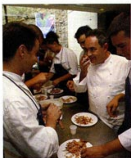
Catalan star: Chef Ferrán Adrià.

This autonomous Spanish region cherishes its independence.