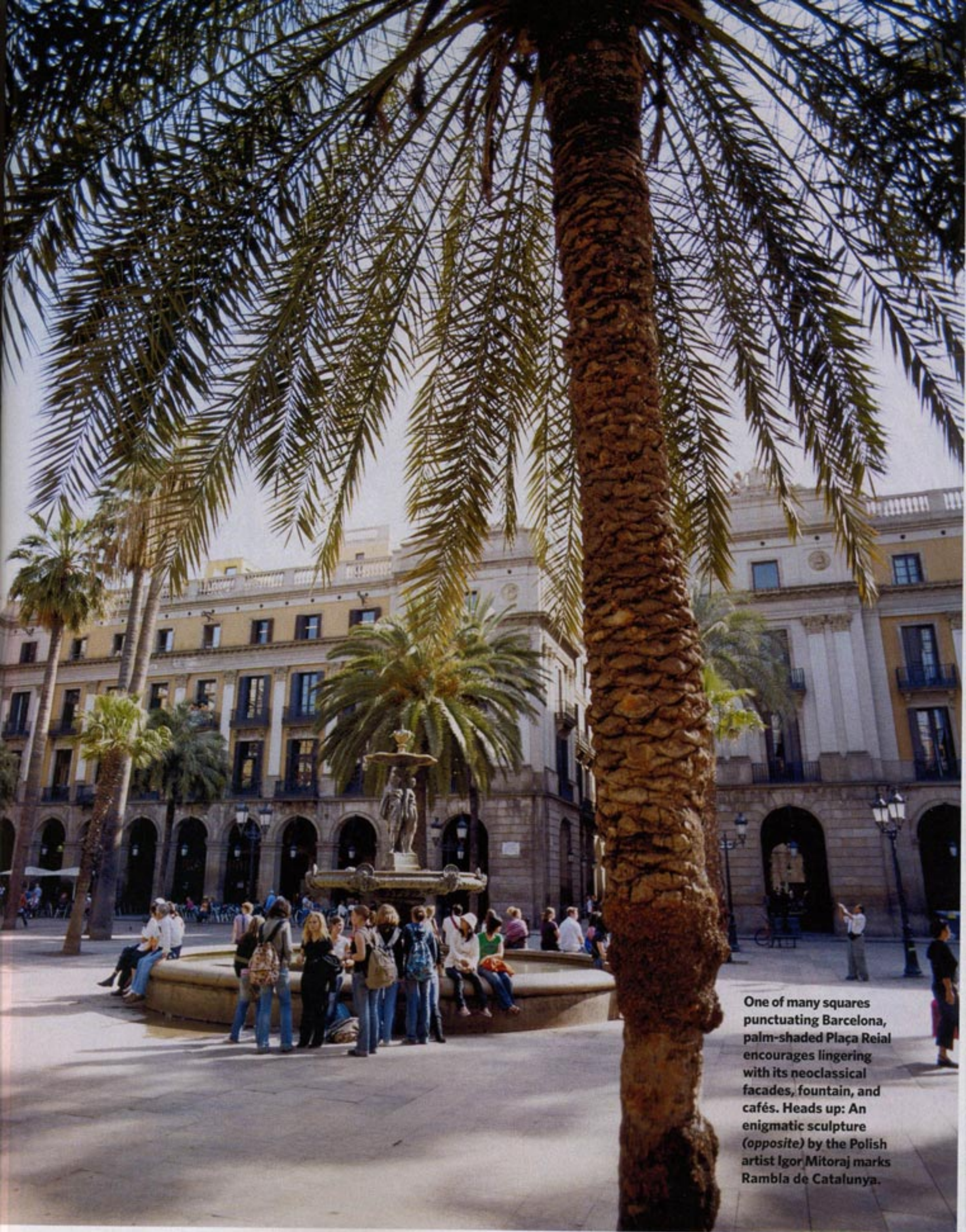
One of many squares punctuating Barcelona, palm-shaded Plaça Reial encourages lingering with its neoclassical facades, fountain, and cafés. Heads up: An enigmatic sculpture (opposite) by the Polish artist Igor Mitoraj marks Rambla de Catalunya.